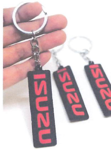
Self defense keychain kit

Replace the pom-poms with a customized rubber keychain DOST-STII Logo with a text (DOST-STII @ 36)